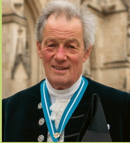
Henry Robinson Chair